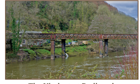
The Viaduct at Redbrook