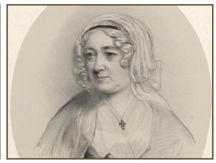
Dowager Countess of Dunraven