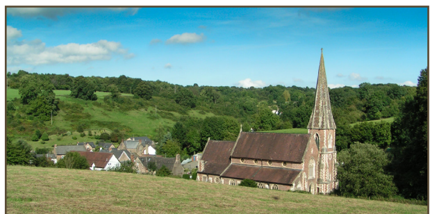
St Peter's church built by Caroline Dunraven

If you find that the footpath you need is obstructed by crops, walk around the edge of the crops until you reach the next stile.